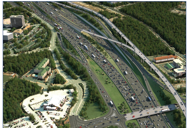
Artist rendering of the Managed Lane System Flyover at Windy Hill Road

Since then, Georgia DOT has made important changes: the project remains a P3, but the method of delivery has changed to Design-Build-Finance (DBF). DBF is more streamlined, requires less private financing, provides greater state control and still allows benefit from the investment, innovation, and expedited delivery of a P3. The private partner will contribute initial funding of 10 - 20 percent of the total project cost, and be responsible for design and construction of the project. The state will provide oversight of the construction and retain responsibility for operations and maintenance of the roadway, tolling and long-term financing. The state will repay the private partner after the facility is open to traffic. DBF addresses the Governor's major concern: the state will be able to implement additional transportation solutions in the corridor as needed. Under this delivery process, the project is moving forward with full support from Governor Deal, Georgia legislators, and the State Transportation Board.